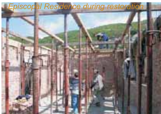
Episcopal Residence during restoration

The implementation of this one-year project started in March 2007 and after preliminary and demolition works, carried out in April, the final static analysis and conclusions regarding bearing structures of the buildings is being completed ■