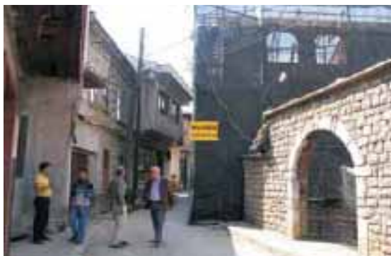
Orthodox Seminary after destruction