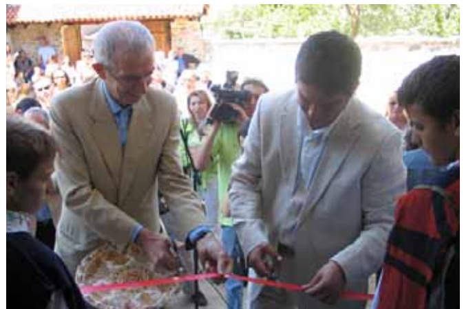
Chief of Liaison Office of European Commission, Giorgio Mamberto and Culture Minister of Kosovo, Astrit Haracija, cutting the ribbon of Saraj House in Velika Hoca