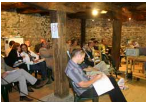
A moment from the seminar